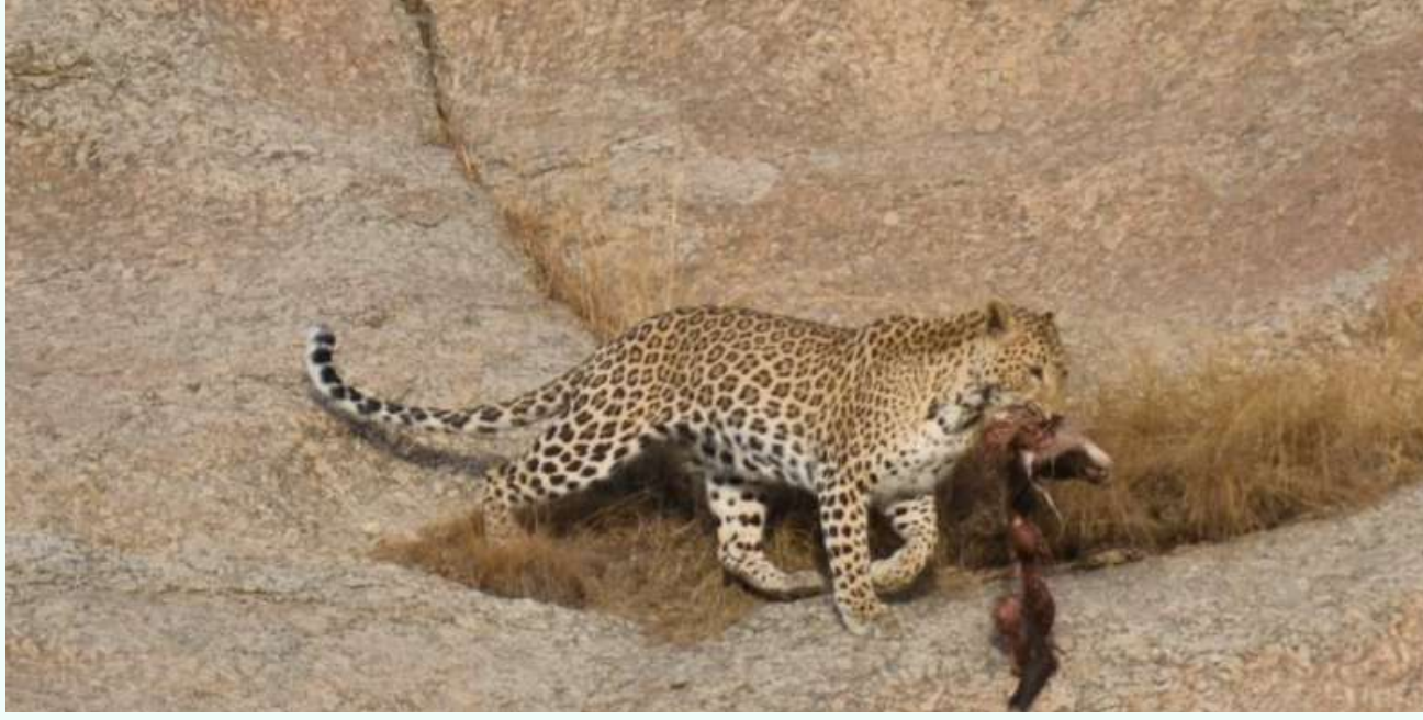
A MOTHER LEOPARD TAKES A FRESH KILL TO FEED HER CUBS

CLICK THE PICTURE, TO READ A REPORT BY THE YOUTH AMBASSADORS ABOUT THEIR TRIP TO JAWAI, INDIA