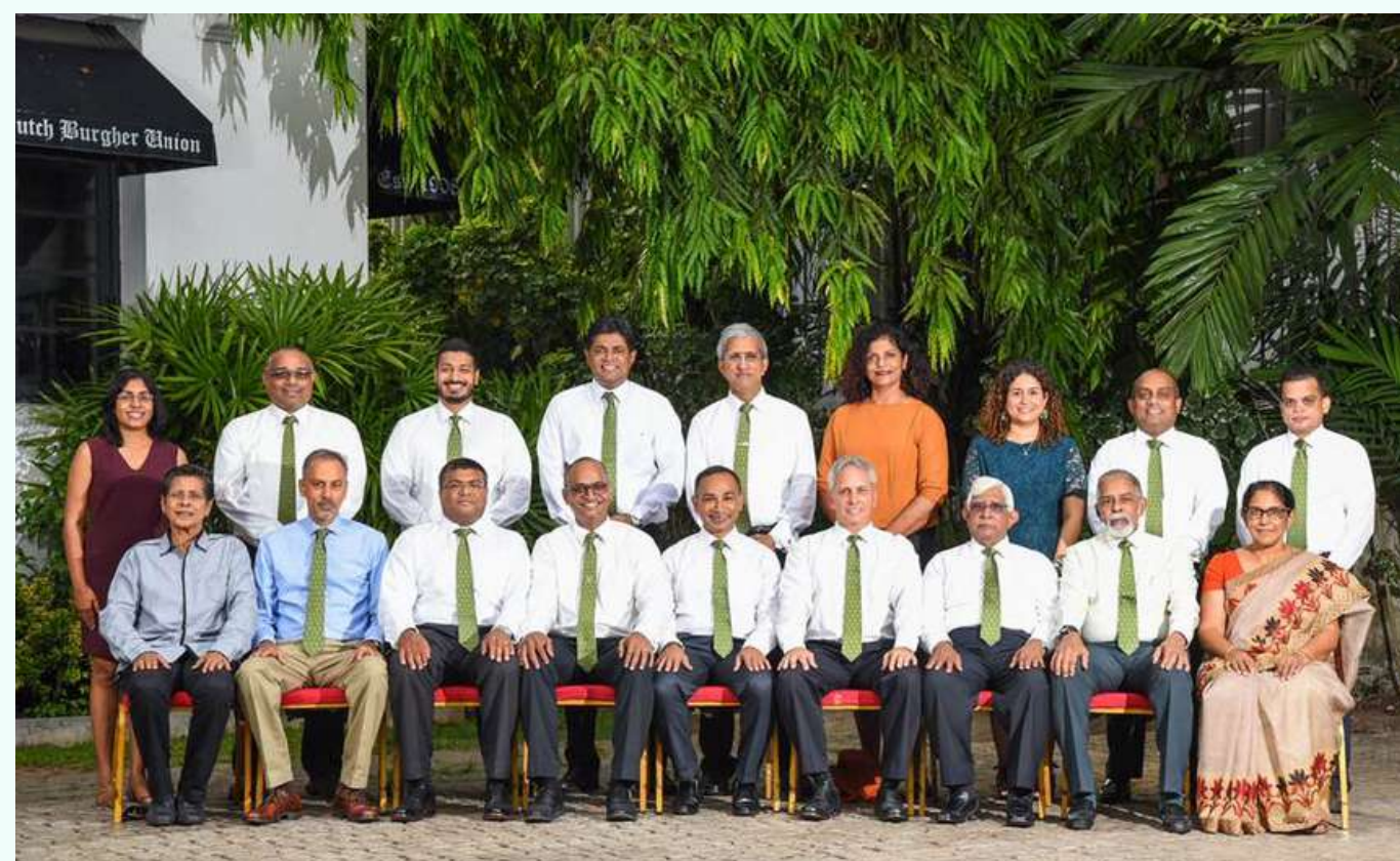
SINCERE THANKS TO OUR OUTGOING COMMITTEE OF 2018/19 FOR ALL THEIR HARD WORK